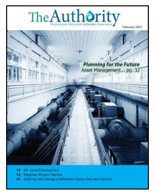
February 2023 In this issue...

Dealing with Being a Defendant (Early Do's and Dont's)