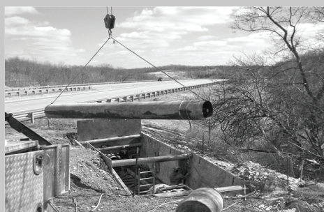
Dutch Ridge Road and I-376 Waterline Crossing Brighton Township Municipal Authority

Facilities Planning, Design and Construction Phase Services