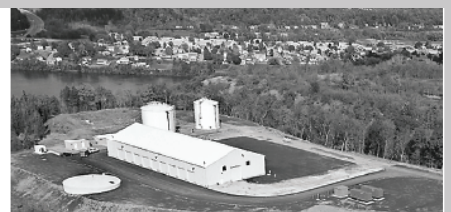
Award-Winning $65 Million River Intake & Interim Water Treatment Facility Center Township Water Authority